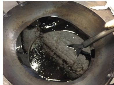
Fig 4: Injection of sasobit into asphalt