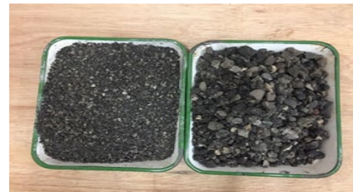
Fig 2: Reclaimed asphalt

Reclaimed asphalt (RAP) is asphalt mixture which has already been use and is reused again to produce new asphalt pavement.