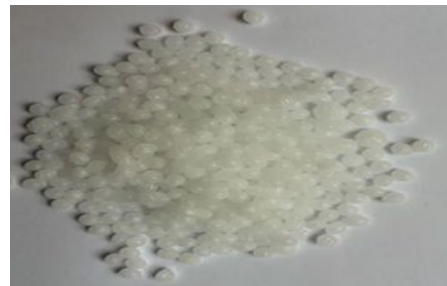
Fig 1: Sasobit

It is manufactured from natural gas using the Fisher Tropsch process of polymerization.