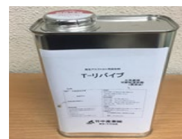
Fig 3: Rejuvenator

Rejuvenator is a substance used to restore original properties to aged (oxidized) asphalt binder by restoring the original ratio of asphaltenes to maltenes.