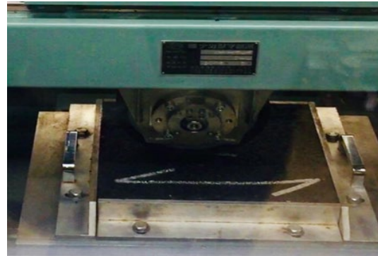
Fig 5: Wheel tracking test setup